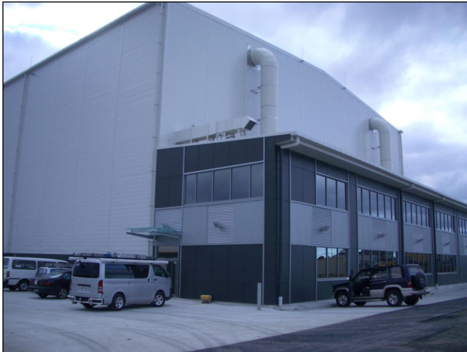
Figure 6: The purpose built sound stage at Henderson Valley Studios

A significant component of the joint venture has been the construction of a purpose-built sound stage. The sound stage was built between 2006 and 2007. It is some 2000m 2 in size and cost approximately $7 million to build. It has a height of 14.7 meters to the lighting grid. Approximately $1 million (GST inclusive) was provided by New Zealand Trade and Enterprises' Major Regional Initiative fund while the remainder was provided by Tony Tay Film Limited.